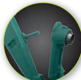
Release extractor for taking out sample