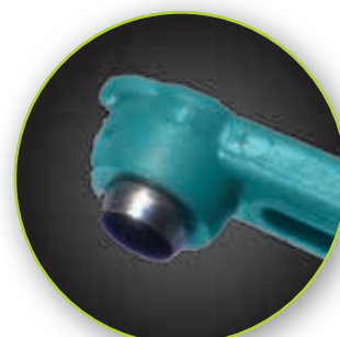
Stainless steel punch