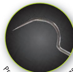
Probe diamond # 23 edge