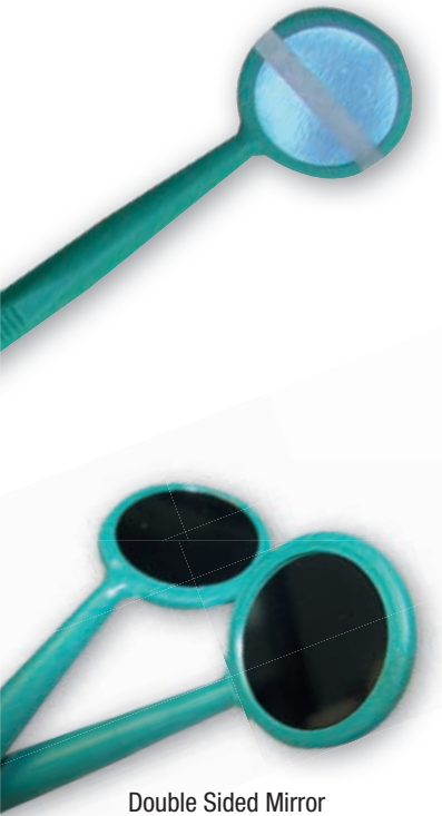
Double Sided Mirror

High quality and lightweight front surface mirror. One piece handle and mirror. Poly film protector with a pull-off tab. Available also with a double-sided mirror. Not made of glass, which increases the safety of the patient and eliminate surface reflection depth loss.