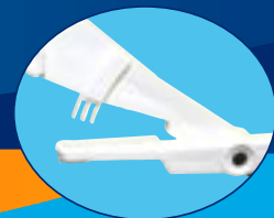
Easy removal of biopsy

CAT No 5350 GYNIUS PUNCH® Biopsy punch BULK NOT STERILE 100 bulk in a box